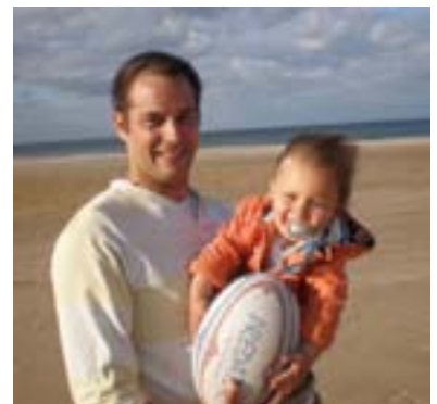
Kings' youngest recruit