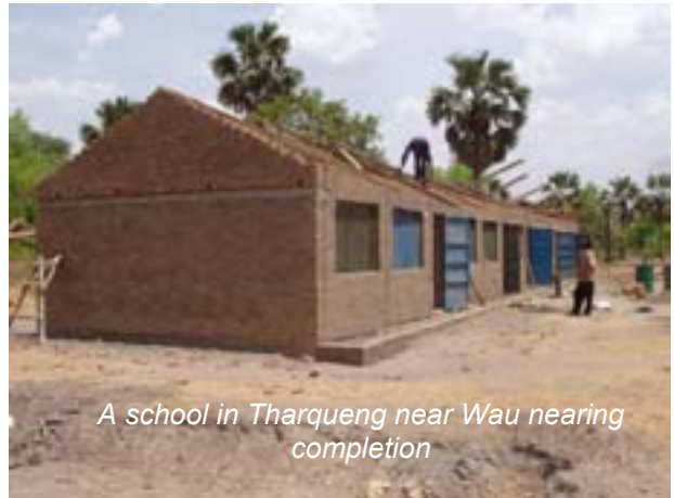
A school in Tharqueng near Wau nearing completion

Here I was construction projects focal point, managing a building project in the Diocese of Wau – that has since delivered three excellent value schools – providing support to the work of the Salisbury Support Group in assisting the development of Juba Diocesan Model Secondary School, and networking amongst government and non-governmental organisations (NGOs) for support for the Church’s education work. This job not only helped me to learn on the job how full scale projects are run, but also put me in contact with many interesting people – both Sudanese and international – whilst allowing me unprecedented policy involvement in education at Government of Southern Sudan (GoSS) level.