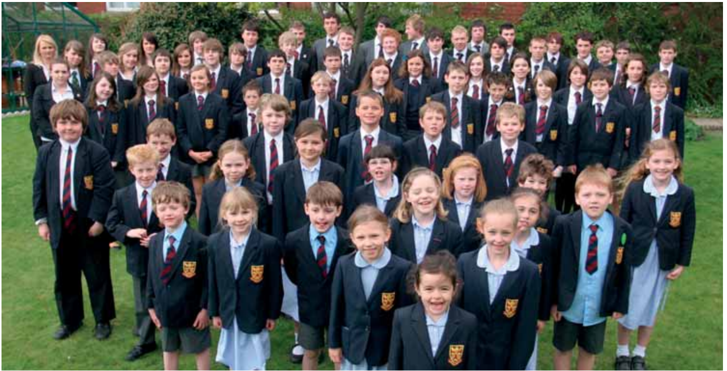
Alumni Children, Summer 2010