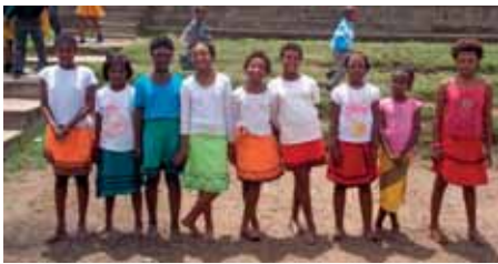
The girls traditional dance group

Earlier this year we were given the opportunity to go to the Eastern Cape of South Africa for five weeks to help with the completion of an amphitheatre being built in collaboration with Dodgy Clutch and Ryder Architects. The amphitheatre was designed here in Newcastle, but it is being made from local and naturally sourced materials, by a team of local people and local businesses. Whilst we were there, we focussed on the completion of the seating, which was left unfinished