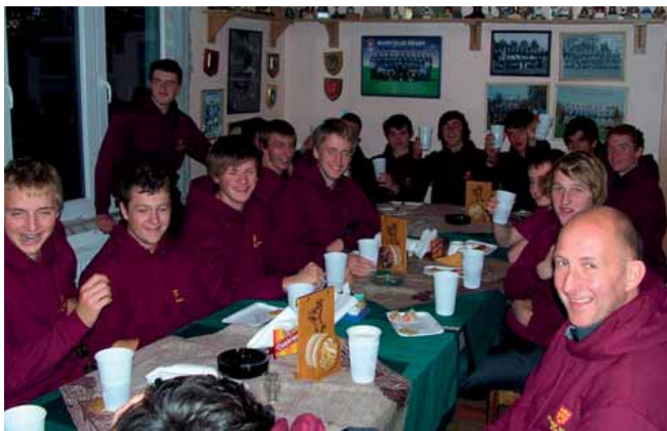
End of tour meal at a traditional Czech restaurant