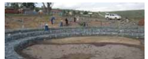
On site completing 3rd row

the third row was just being finished, and the fourth row has also just been completed in the beginning of December, putting us ahead of schedule! The whole experience was incredible to be a part of and when the roof is raised in early 2011 the anticipation will be over!