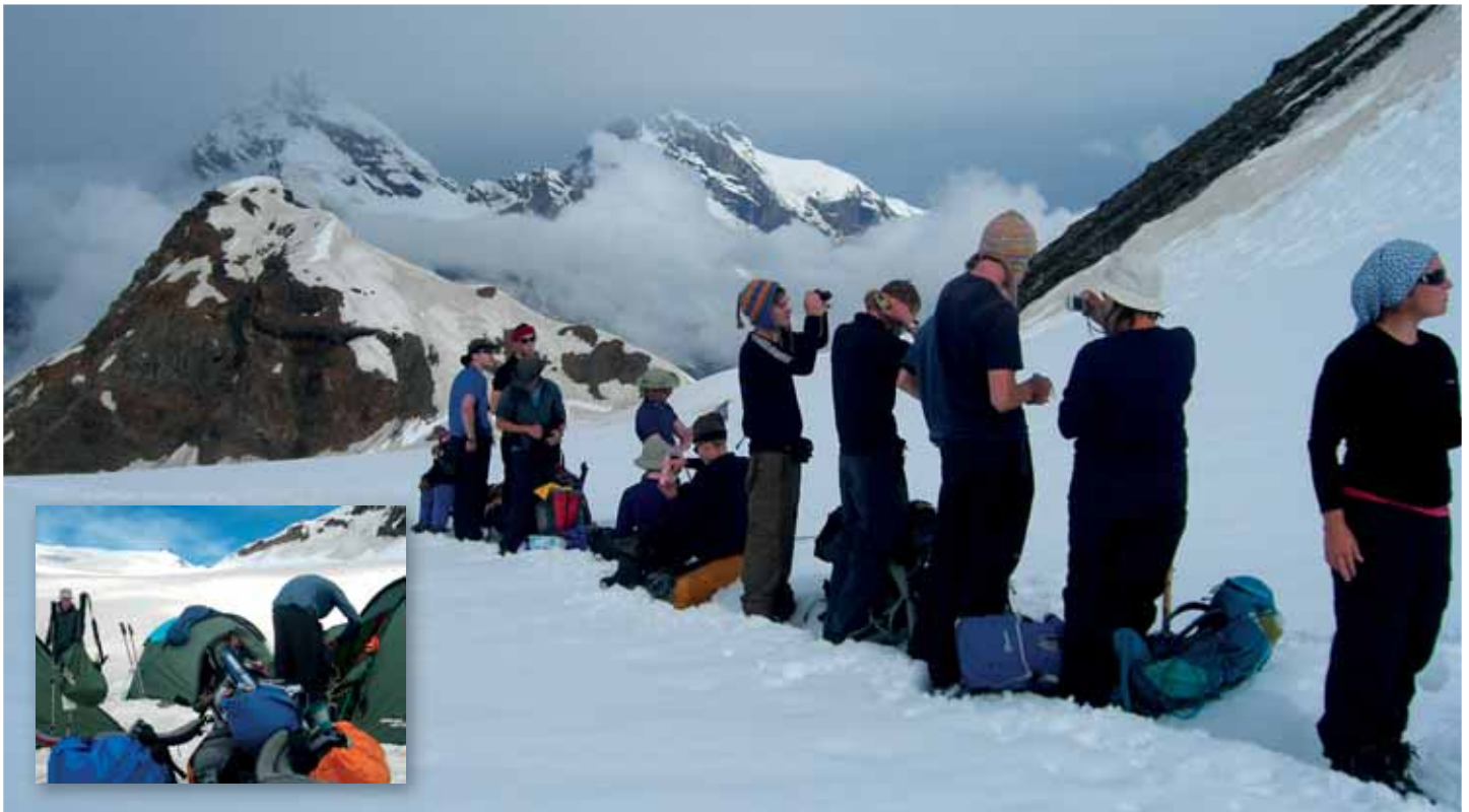
World Challenge Expedition to the High Himalaya, 2010

We have enjoyed a very busy and productive term in both Junior and Senior schools and it has been my great pleasure to have had an opportunity to work with pupils, staff and parents to restate some of our core principles of courtesy, good manners, integrity and the importance of treating others with respect. In early September we celebrated the successes of our pupils, both past and present at our annual Prize Giving in The Sage, Gateshead. This year we added pieces by our choir and orchestra to the traditional hymn and National Anthem. The outgoing Upper Sixth had indeed done as well as we had hoped for with 90% gaining their first choice university after 60% of A level grades were A*, A or B, with 100% pass rate as in the past four years. That 10% of all A level grades at King's were the new A* grades were outstanding reward to pupils and staff who have worked so hard together. Some of our pupils who exceeded their expectations are reapplying this year having planned to take a productive GAP year and should take up improved places in 2011.